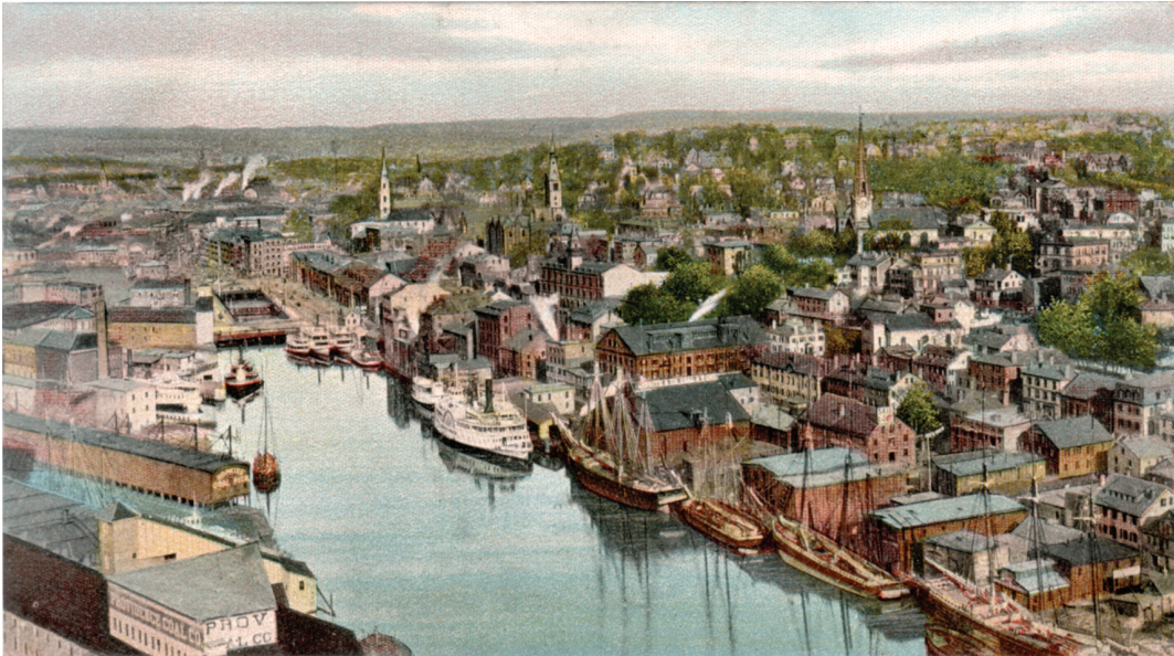
2182—Head of Providence River, Providence, R. I.

Souvenir Post Card Co., New York and Berlin.